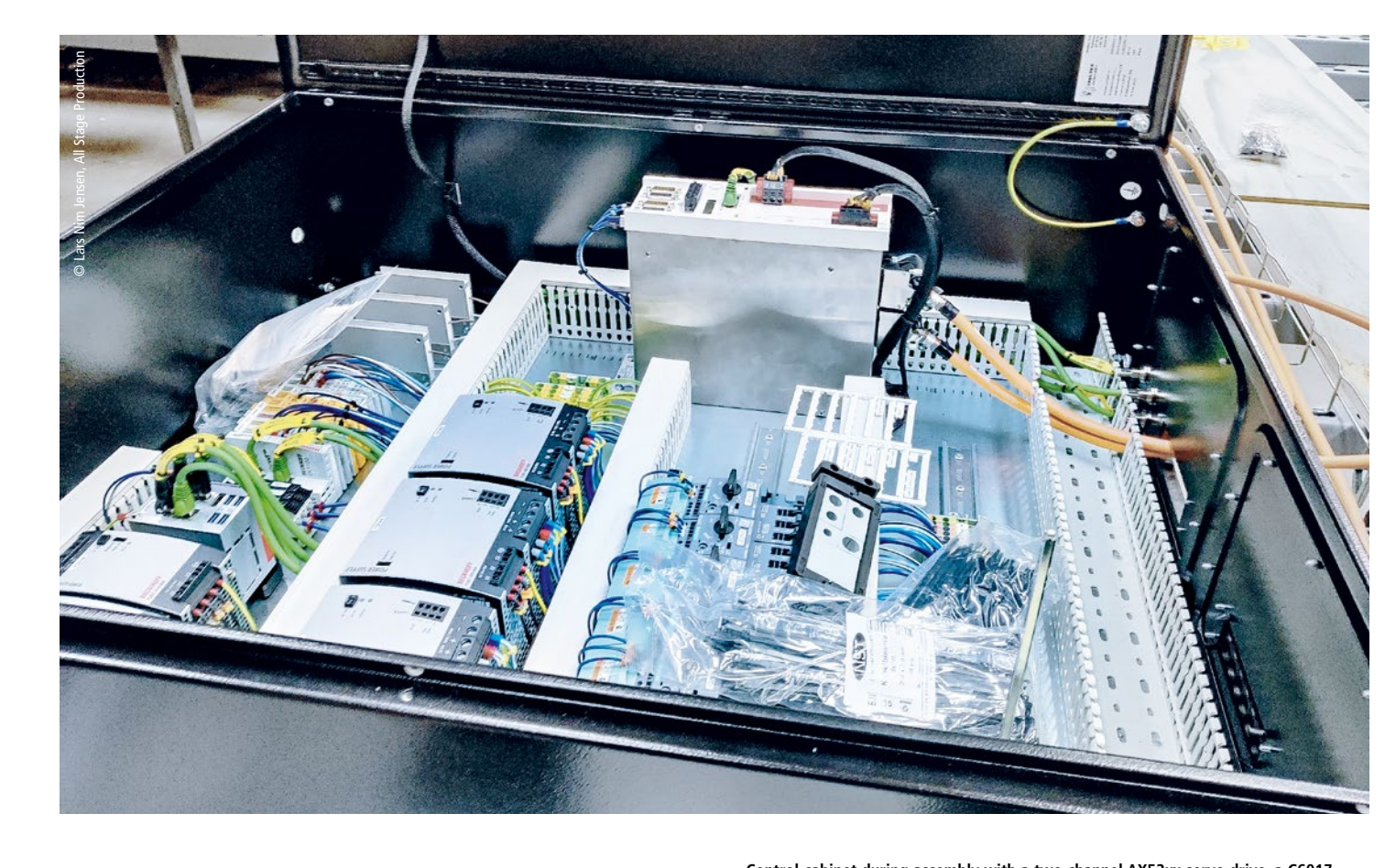
Control cabinet during assembly with a two-channel AX52xx servo drive, a C6017 ultra-compact Industrial PC, and several PS3000 power supply units for the AMI8100 distributed servo drives