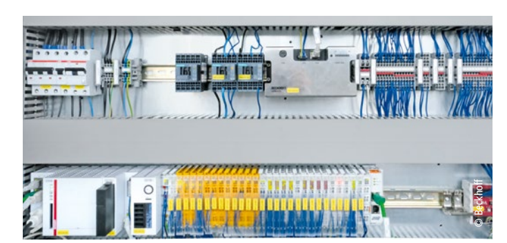
Complete control and monitoring of the prototype runs on a CX2040 Embedded PC (bottom left) with Intel® Core™ i7 CPU and four processor cores.