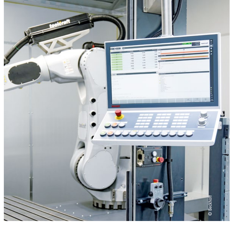
Operation and path planning are carried out in G-code, just as the 5-axis CNC, and visualized on a customer-specific CP3921 multi-touch Control Panel.