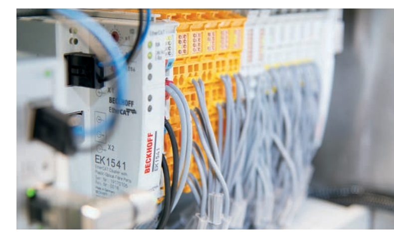
Safety technology is seamlessly integrated into the automation platform using safety I/O components.

The modular XTS system and PC-based automation architecture from Beckhoff not only facilitate excellence in terms of dynamics and precision, they also provide the required modularity and flexibility for the Flexim Open Automation System. "By being able to use an integrated development environment, TwinCAT 3 enabled us to optimize the various design phases and achieve excellent results. Last but not least we benefited from the competent and continuously available technical support offered by Beckhoff Italy," said Andrea Pozzi.