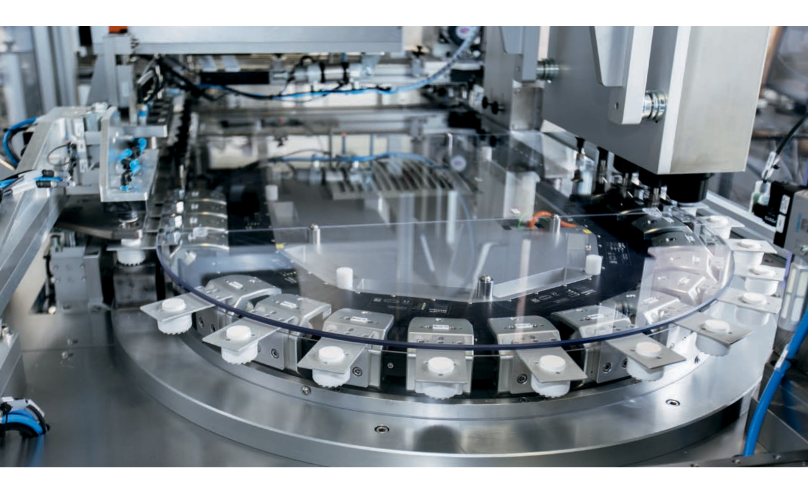
The Goldfuß cap assembly line benefits from XTS's sophisticated software functionality and is both highly compact and flexible to operate.

The system processes granular material, so it is pressurized and therefore completely enclosed to guard against high levels of dust and dirt. The handling equipment – the elements that variously grasp, lift, push against and compress the parts being processed – is controlled pneumatically by valve terminals. A conveyor weigh scale checks the fill weight of the products at the end of the line. The entire system is controlled by a C6930 Industrial PC, operated from a CP3919 19" multi-touch Control Panel connected via a CP Link 4 combined